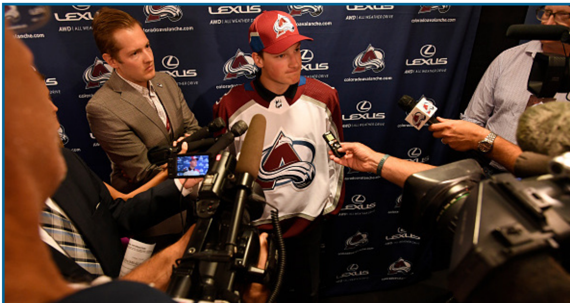
Cale Makar addresses the Denver media at Pepsi Center following the 2017 NHL Draft, where he was selected with the fourth-overall pick.