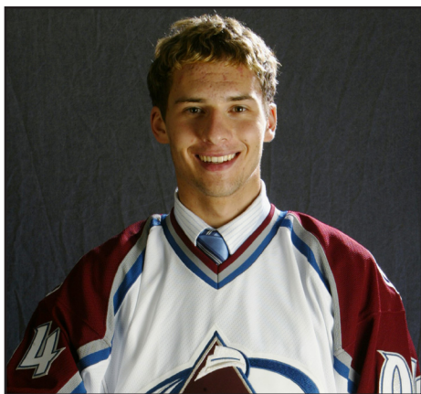
Wojtek Wolski became the first Polish player to be drafted by the franchise when he was selected in the first round in 2004.