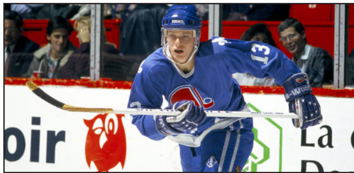
Swedish center Mats Sundin, selected by the Quebec Nordiques with the first-overall pick at the 1989 NHL Draft, became the first European player to be taken first overall in NHL history.