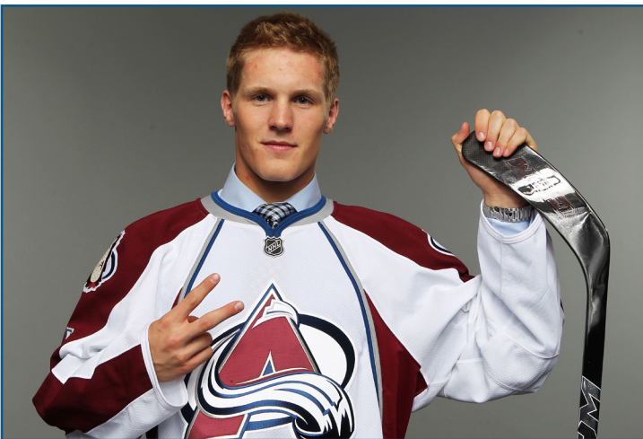
Avalanche captain Gabriel Landeskog, selected with the second-overall pick in 2012, is the highest-drafted left wing in franchise history.