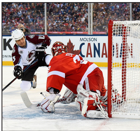
Valeri Kamensky, pictured at the 2016 Coors Light Stadium Series Alumni Game at Coors Field, was the first Russian-born player to be drafted by the organization. He was selected by the Quebec Nordiques in the seventh round (129th overall) of the 1988 NHL Draft.