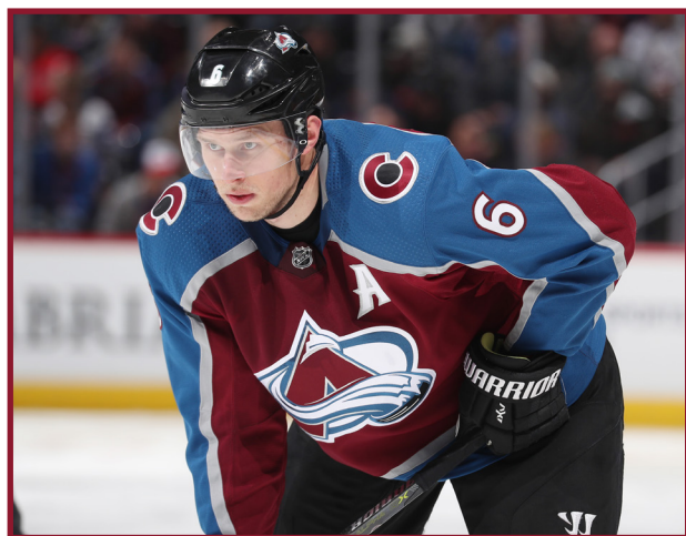
Erik Johnson is one of three first-overall picks on Colorado's roster and three defensemen who were opening-round selections.

Of the first-round draft picks on Colorado's roster, two have been selected to represent the Avs in the NHL All-Star Game (Johnson (injured - DNP), MacKinnon) and two have won the Calder Memorial Trophy as the league's top rookie (Landeskog, MacKinnon).